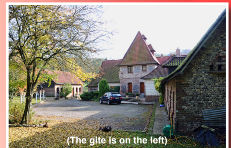
(The gite is on the left)